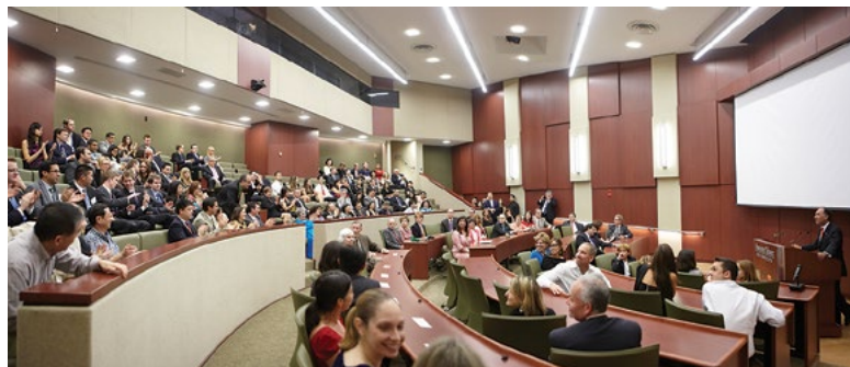
José A. Berrocal Auditorium, Bascom Palmer Eye Institute

Bascom Palmer offers a wide variety of educational opportunities in addition to its highly regarded continuing medical education courses and distinguished lecture series. Each Thursday morning from 7:00 a.m. to 8:30 a.m., Grand Rounds is presented virtually . Faculty, residents, fellows, medical students, and the global ophthalmology community come together to learn of the newest clinical research and treatments to increase their medical knowledge and improve patient care.