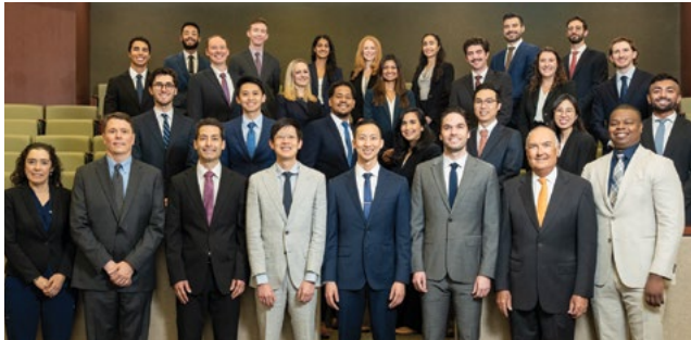
Residents’ Days 2025