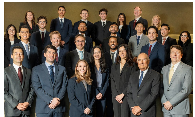
Residents' Days 2024