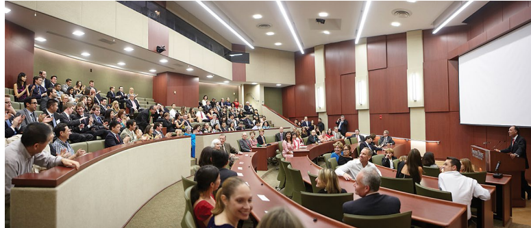
José A. Berrocal Auditorium, Bascom Palmer Eye Institute

Bascom Palmer offers a wide variety of educational opportunities in addition to its highly regarded continuing medical education courses and distinguished lecture series. Each Thursday morning from 7:00 a.m. to 8:30 a.m., Grand Rounds is presented virtually . Faculty, residents, fellows, medical students, and the global ophthalmology community come together to learn of the newest clinical research and treatments to increase their medical knowledge and improve patient care.