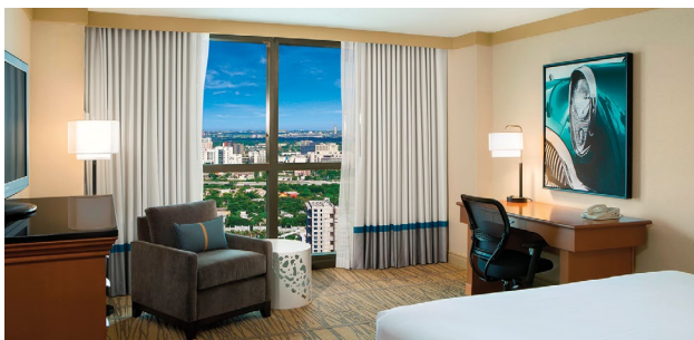
DoubleTree by Hilton Hotel Miami Airport & Convention Center